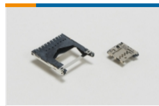
SD Card Connectors(1)